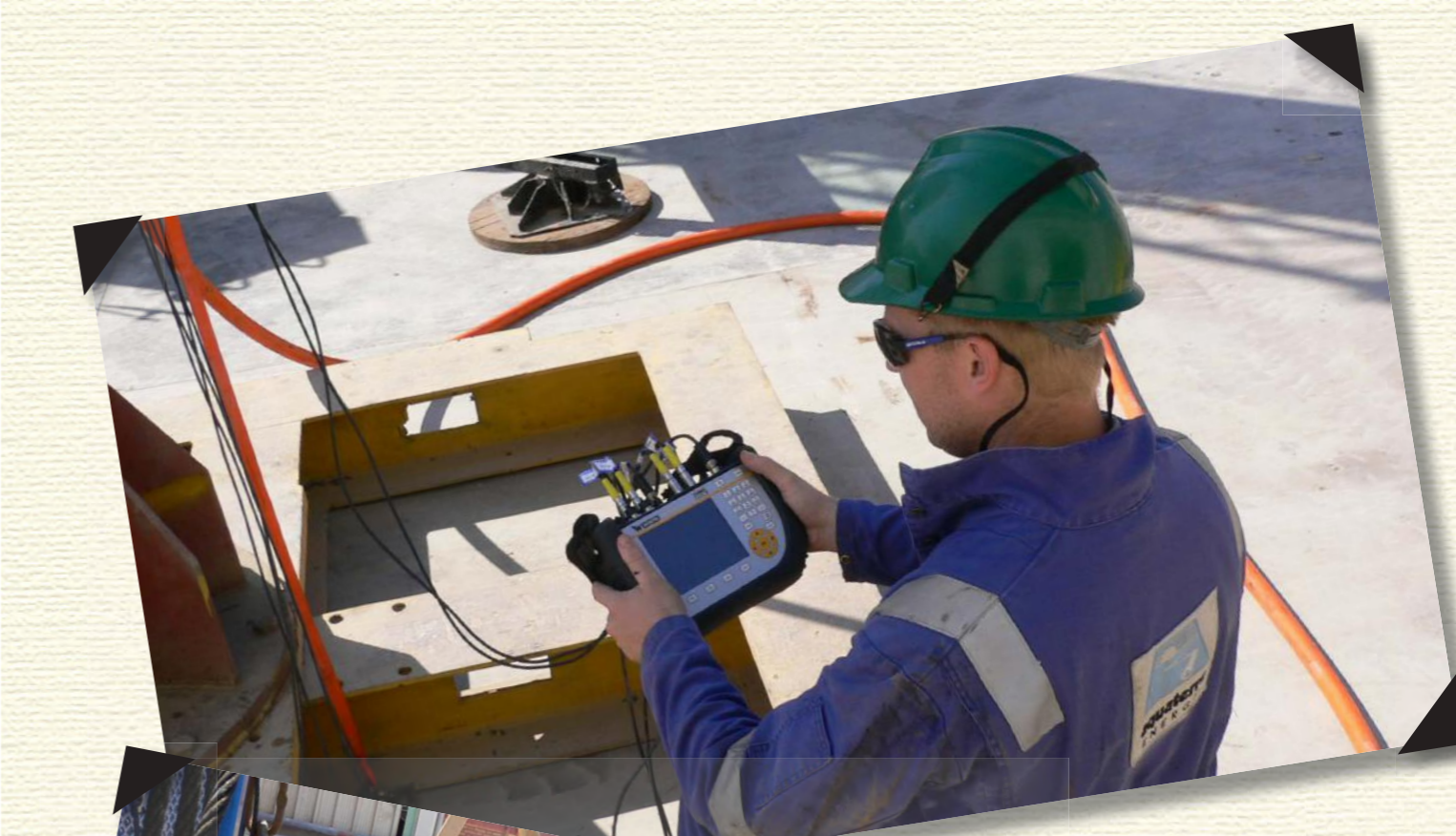
HPM6000 in use

The HPM6000 turned out to be as simple to operate as the average mobile phone, the graph readouts were clear and simple to understand, the battery only needed to be recharged once in three days of testing and, despite the fact that the work was conducted in bright sunlight, the equipment screen was clearly visible.