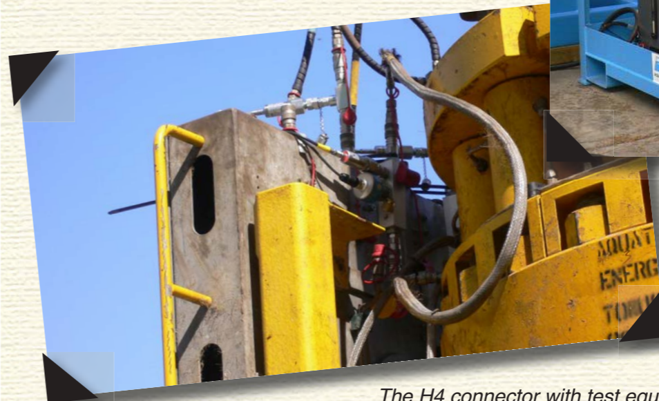
The H4 connector with test equipment attached