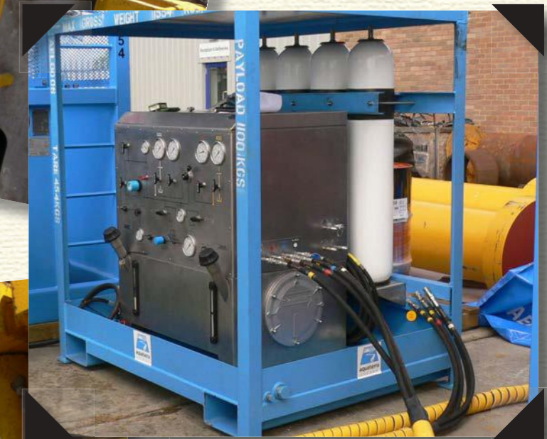
Hyco's Hydraulic Power Unit (HPU)