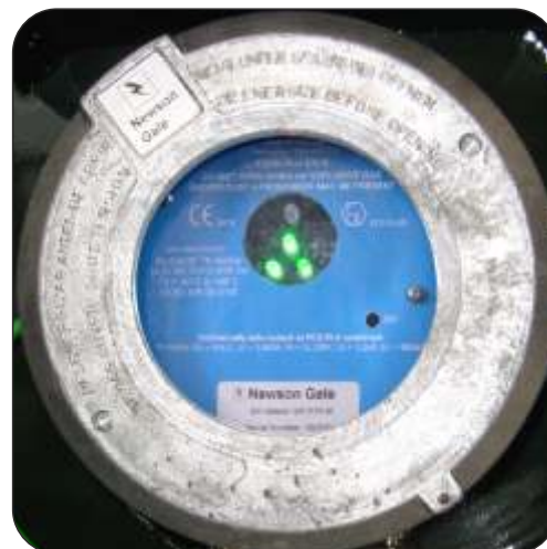
Fig. 3 Earth-Rite® PLUS ground status indicators pulse continuously when grounding is in place.

The Earth-Rite® PLUS can be powered off a 110 or 230 volt AC source or 24 volt / 12 volt DC source and is cCSAus approved Class I, Div.1 for gas groups A, B, C, D and all combustible dust and fibre groups.