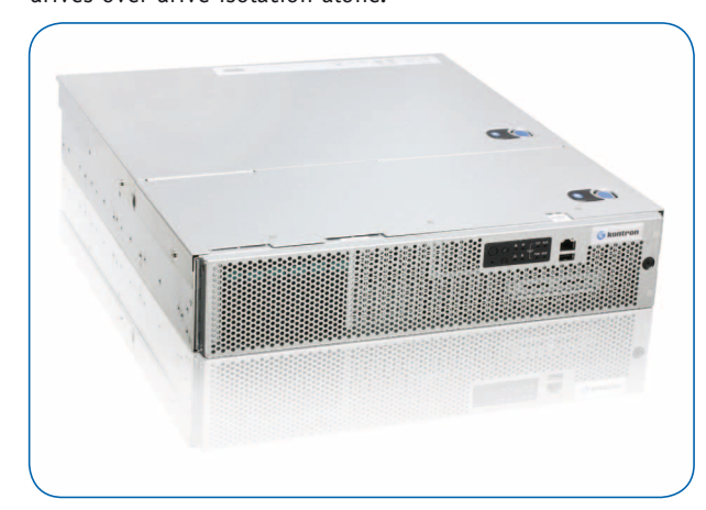
The Kontron CG2100 is a NEBS-3 and ETSI-compliant 2U rack mount server that features the company's proprietary vibration suppression technologies.

The proprietary vibration suppression technologies in Kontron's communication rack mount servers are designed to significantly reduce the amount of vibration by isolating both vibration-generating devices and vibration-sensitive devices. The company's 1U and 2U Carrier Grade and IP Network servers utilize a unique vibration-absorbing material allowing its designers to isolate both the fans and hard drives from direct contact with the system's metal infrastructure so they literally "float" inside the chassis. This approach requires that the initial system design includes vibration suppression as a key requirement. For example, the typical enterprise server hard drive "cage" is integrated tightly with the main chassis walls and/or floors. While this is efficient from a design point-of-view, it allows vibration to be transmitted directly to the hard drives. And while the drives can be, and should be, isolated from the cage, Kontron has found that creating a self-contained drive cage and isolating the entire cage from the chassis greatly reduces vibration-induced performance loss of the drives over drive isolation alone.