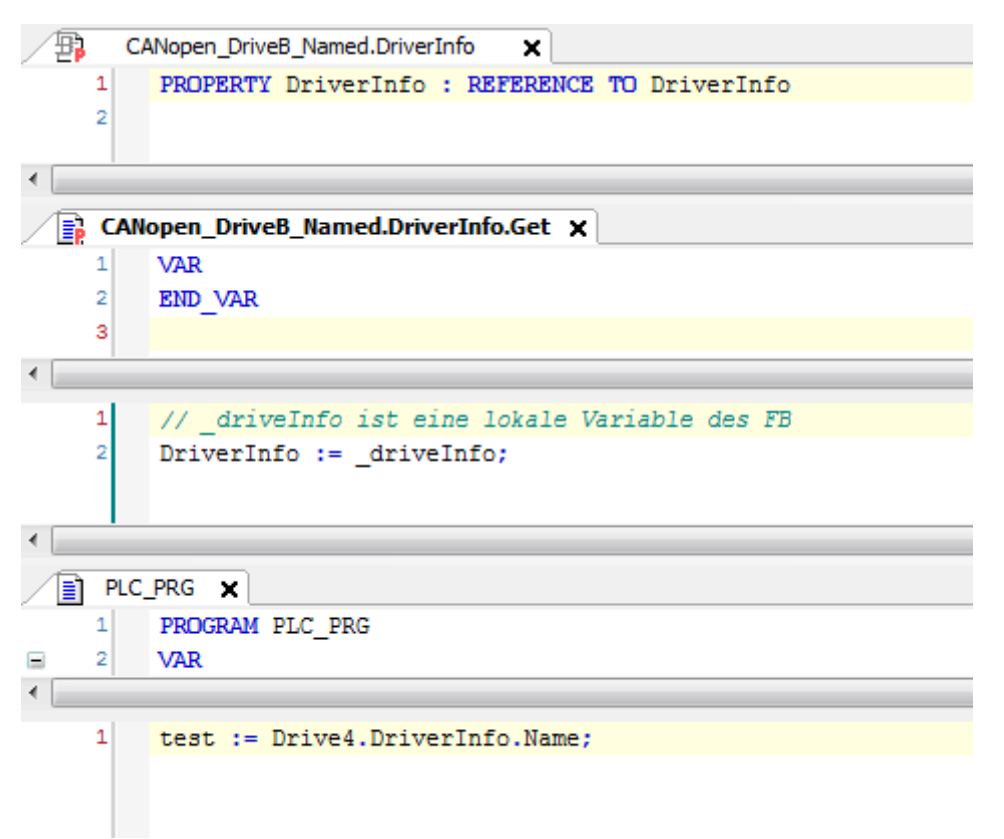
Fig. 4: Complex data types and properties

For our sample project we assume a structure, DriverInfo , with the elements Name and Version . Instead of two properties for the name and the version, the entire information could also be returned as a structure. We give the function block Canopen_DriveB_Named an additional method. This does not return a simple data type, but a whole structure.