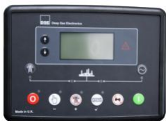
DSE6120 MKII AUTO START & AUTO MAINS FAILURE CONTROL