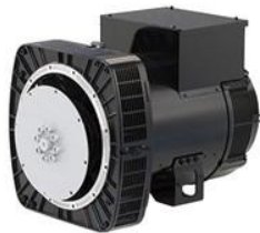
Leroy Somer TAL-044-J