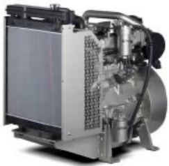
PERKINS Engine 1106A-70TAG2