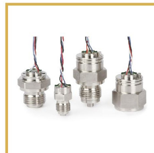
Pressure Gauge Parts