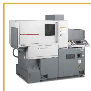
CNC Swiss-Type Turning Centers