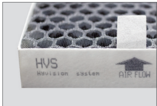
Replaceable 3-way air filter.