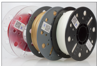
Support multiple print materials. (ABS, PLA, TPU filaments)