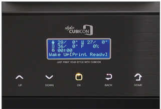
Easy operation with Touch button.