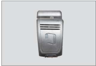
Module type Extruder.