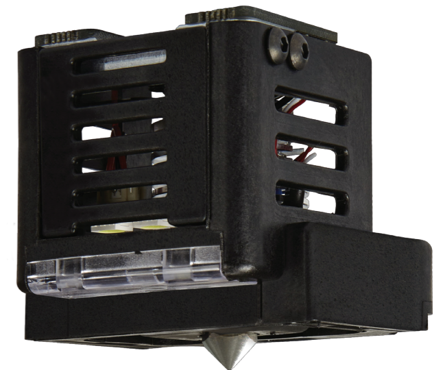
Extruder Nozzle System for the Cubicon 3D Printer

Jason: We have spent a lot of time and our own resources to search for the ideal 3D printer and we found it in the Cubicon 3D printer from South Korea. The advantage is the Cubicon 3D printer works from the moment it is unbox and plug into the wall. It is a simple to operate and reliable 3D printer that comes with many features and functions over the others like Auto Levelling mechanism, 3 Layer of Filter System, Modular Extruder, Filament Detection Sensor to Pause/Continue and able to print in multiple materials.