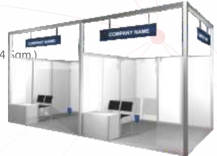
For illustrative purpose only

50% at the time of booking & balance 50% at least two months prior to the show.